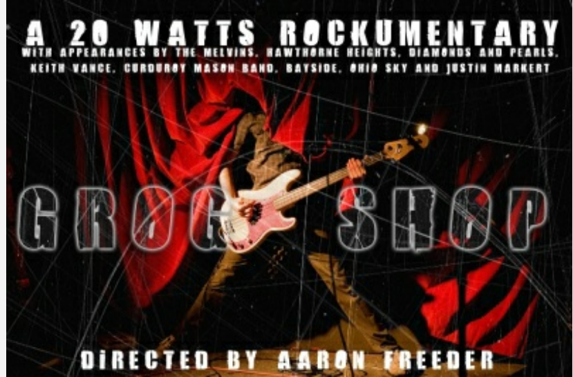
The Grog Shop